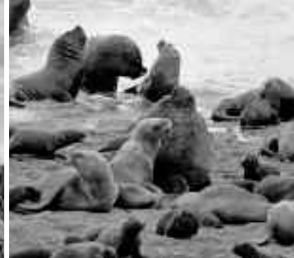
This image is licensed under Creative Commons Attribution ShareAlike 2.0 Germany License