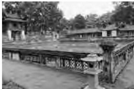
This image is licensed under the Creative Commons Attribution-ShareAlike 2.5 License.

Not Included: All meals and drinks not specified above, tips to drivers and tour director, gratuities, laundry, telephone calls, cancellation insurance, and other personal items.